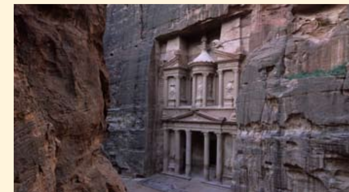
ABOVE: Morning silence in rock-hewn Petra.

Be sure to contact the Jordan Tourism Board North America ( seejordan.org ), an organization that works to connect travellers with all there is to see and do in Jordan. Their site includes links to hotels and festivals.